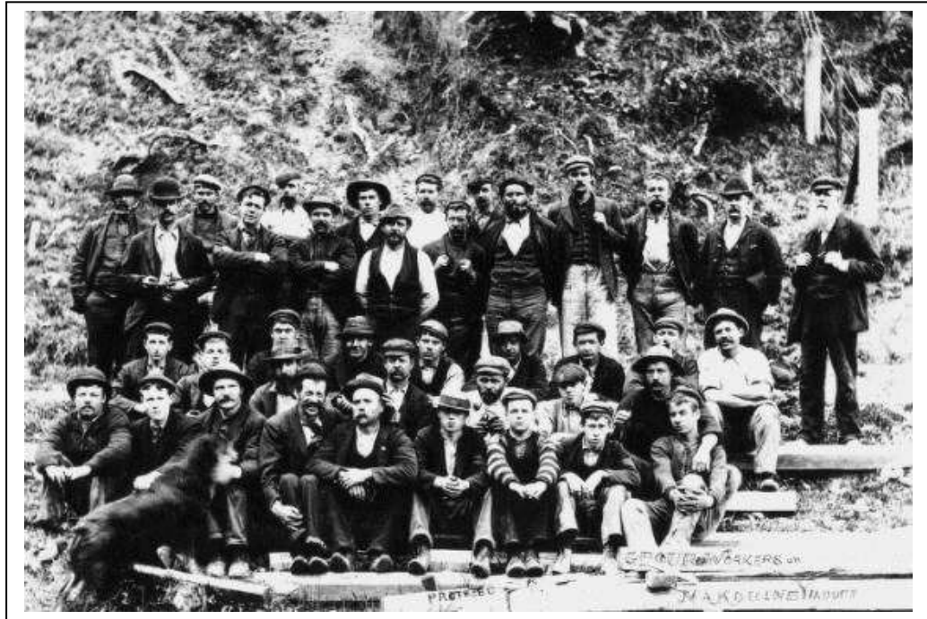
Figure 2: Makohine Viaduct Workers, between 1898-1902.

the principal pier, was killed by falling from the scaffolding, a height of about 80 feet.” 46 There was reportedly one other on-site fatality. 47