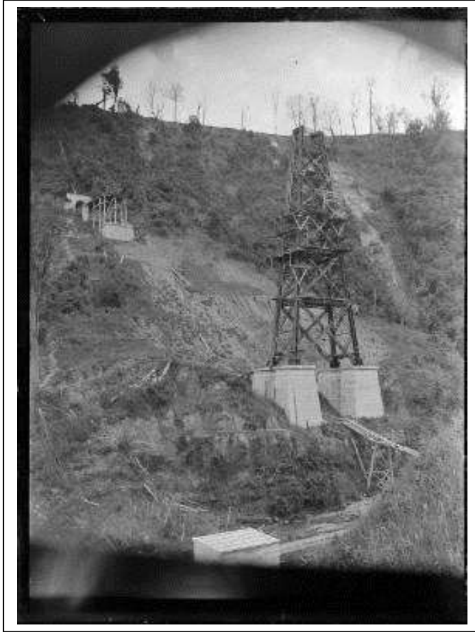
Figure 1: View of the Makohine Viaduct under construction, ca 1900.