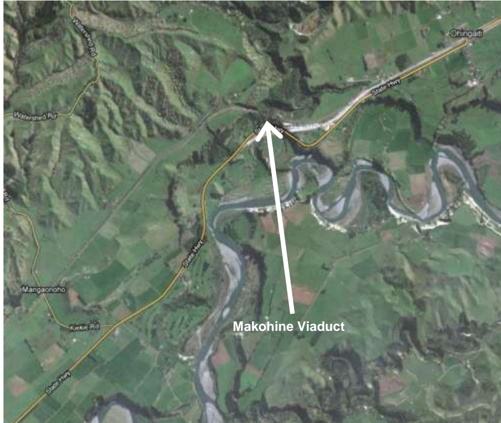
Location map

Access information: The viaduct is best viewed from the valley below. There is a picnic/rest stop on State Highway 1 where traffic can stop safely. The North Island Main Trunk Railway also crosses over the structure.