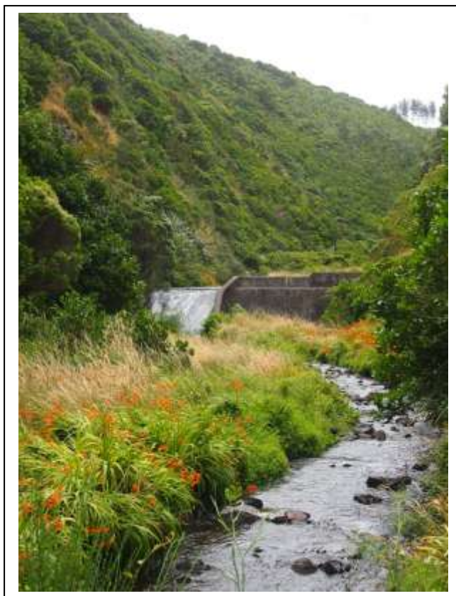
Figure 1: Former Wellington Woollen Manufacturing Company Dam, lower Korokoro Stream, 17 January 2014.

gravity water supply dam for the company further downstream from the municipal waterworks dam (Figure 1). 18