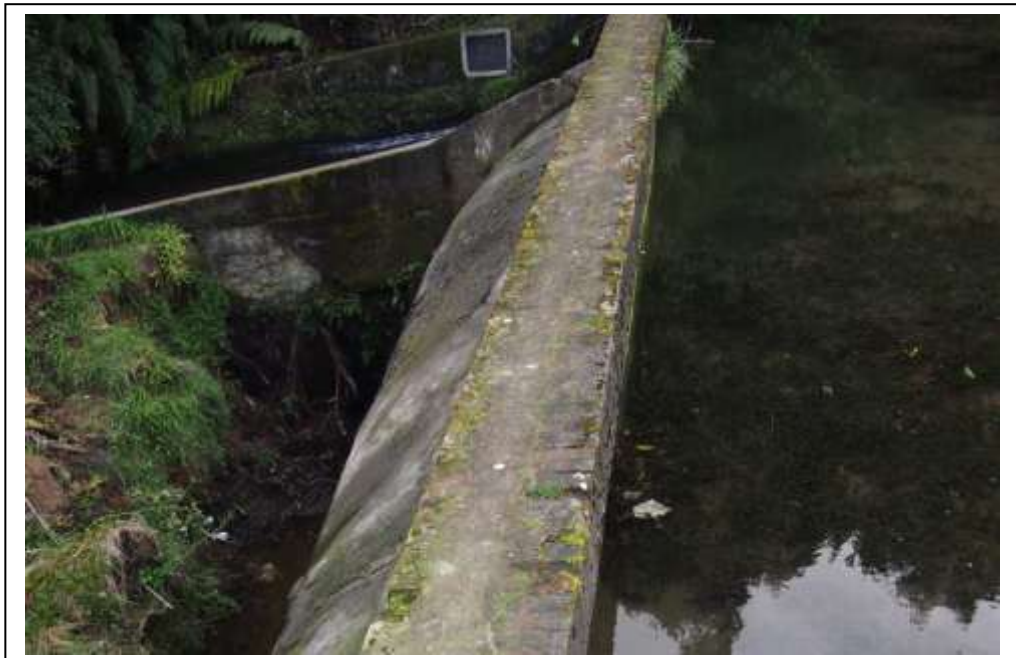
Figure 5: Korokoro Dam crest, 28 August 2013. The foundation stone can be seen at the centre top of the image.

After this initial group of structures, New Zealand's public water supply concrete dams quickly became larger with examples such as Wellington's Upper Karori Dam (1908), Auckland's Waitakere Dam (1910) and the Morton Buttress Dam (1911) in Wainuiomata. The Korokoro Stream Dams provided a starting point for concrete dams in New Zealand, which became the predominant type for water supply and hydro-electric dams until the mid-20th century. 58