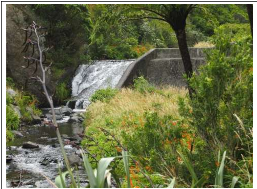
Figure 6: Former Wellington Woollen Manufacturing Company Dam, 17 January 2014.

It appears that the Korokoro Dam underwent few changes, but an associated underground settling tank was built in 1907. 61 Over the years, councillors and engineers proposed increasing the height of the dam, improving supply pipelines and installing pumps, but none of these were advanced. Since the Korokoro Dam was decommissioned in January 1962 the reservoir has been steadily infilling with silt. The dam has now become a feature of the Belmont Regional Park and visitors can walk along the safety-railed south half of the dam's crest to the offtake tower, which is also fenced, with timber seating provided. Remnants of the mains pipes are visible in the stream bed and also alongside the walking track.