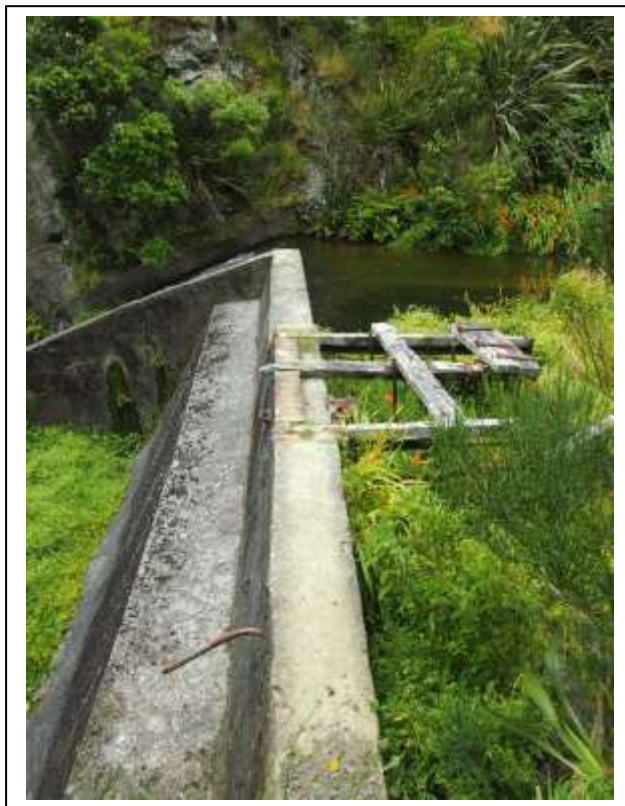
Figure 7: Former Wellington Woollen Manufacturing Company Dam from east Korokoro Stream bank, 17 January 2014. K. Astwood, IPENZ.

By the early 1970s the mill had closed and its buildings were demolished. 62 It is unclear whether the dam continued to be used for water supply up until that time. Since the late 20th century it seems the east bank of the reservoir has been extended through accumulated silt, and vegetation surrounds the timber and steel remnants of the dam's valve tower. Despite having survived several severe floods in the 20th century unscathed, around 2004 a rock slip caused by flooding damaged part of the right abutment wall and a sizable lower west portion of the spillway. 63