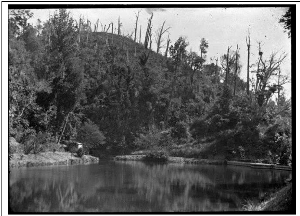
Figure 2: Korokoro Reservoir [26 December 1912].

before the second dam was completed, Wellington Woollen Manufacturing Company took legal proceedings against the Petone Borough Council again. The Council was split over how to proceed, which caused a “Municipal Sensation” in May 1904 when five councillors resigned over the issue. 28 It seems that the Council had not adhered to the terms of the original agreement, leading the company to claim £317,000 for “present and prospective damage caused by interference with its water rights to the Korokoro stream...”. 29 In 1905, the dispute between the Petone Borough Council and the Wellington Woollen Manufacturing Company was effectively resolved through the passing of the Petone Corporation Waterworks Act. The Act formalised the original terms between the two parties and prevented any further chance of litigation. 30